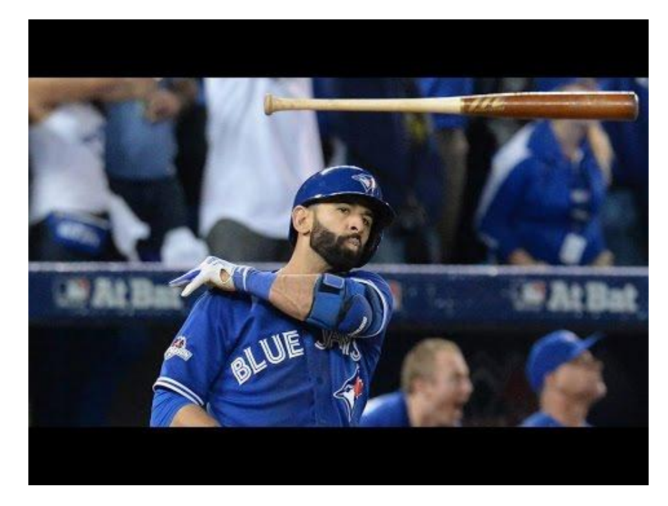
We see a lot more bat flips at our field because the guys we watch are doing it. Nothing wrong with it, but we need to make sure everyone stays safe. Helmets are required in both non-competitive and competitive leagues.